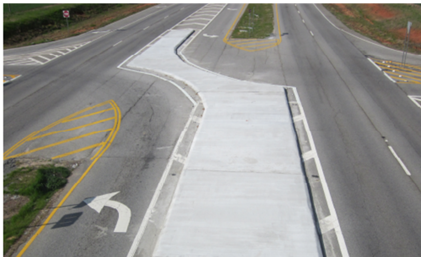
A Reduced Conflict U-Turn (RCUT) intersection along State Route 20 in Henry County

Construction is tentatively scheduled to begin spring 2022. This date is subject to change due to funding or weather delays.